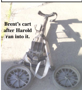
Brent's cart after Harold ran into it.