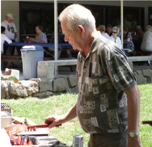
I volunteer to cook and all I get is one lousy can of beer.