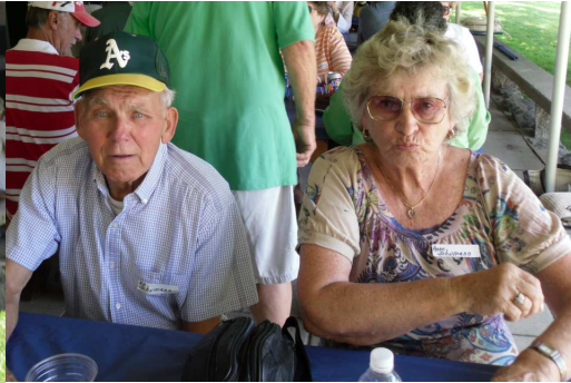
I pucker like this all the time and he just ignores me.