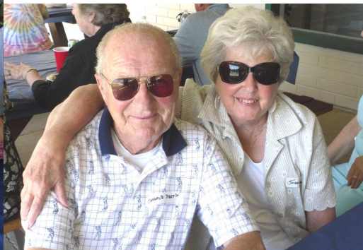
You'd think these two just got married.