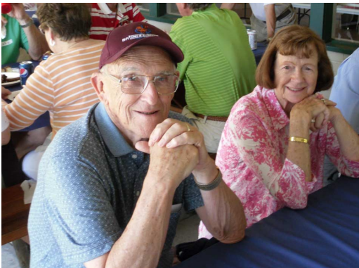
Hey, where's the food