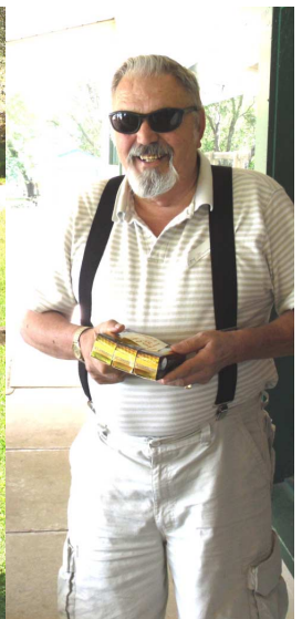
Winner again! If you've got it, flaunt it.