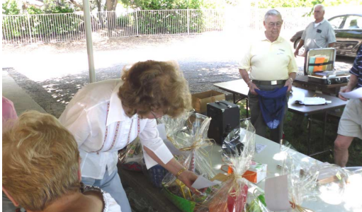
I'd pick this one but I know Jim likes good coffee