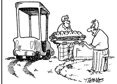
"I said sand wedge."