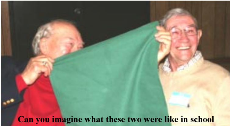
Can you imagine what these two were like in school